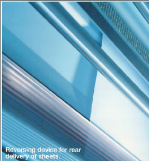
Reversing device for rear delivery of sheets.