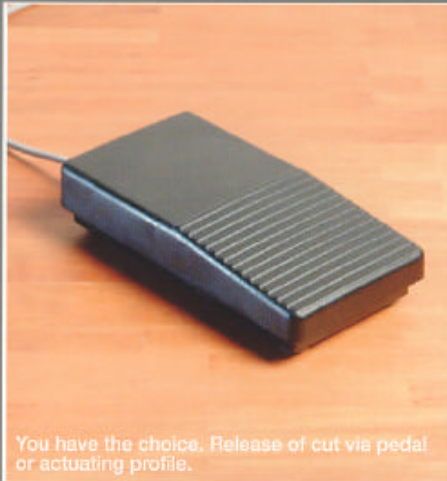
You have the choice. Release of cut via pedal or actuating profile.