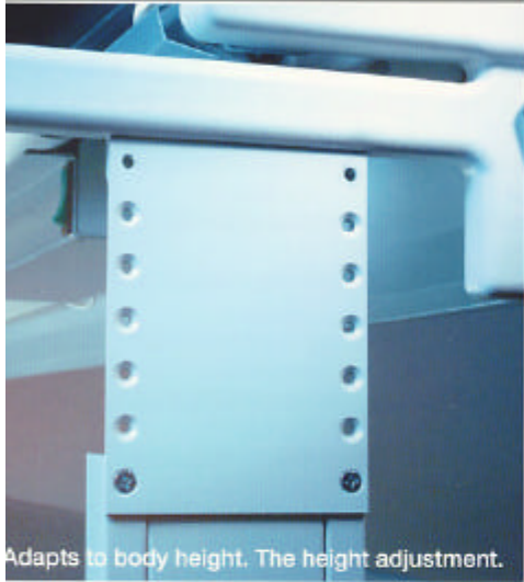
Adapts to body height. The height adjustment.