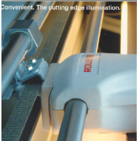
Convenient. The cutting edge illumination.