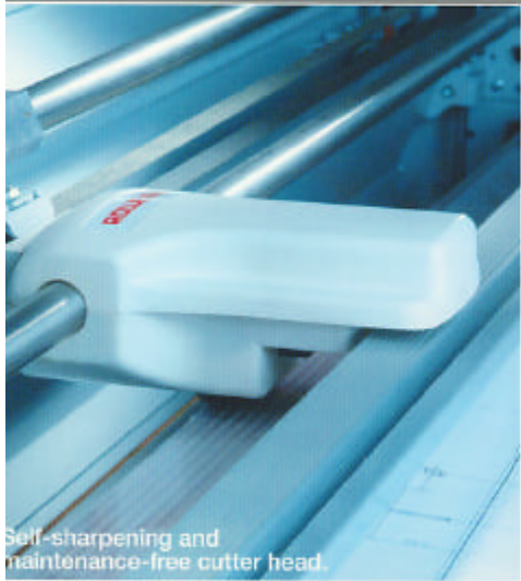
Self-sharpening and maintenance-free cutter head.