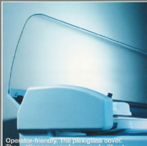
Operator-friendly. The plexiglass cover. The cutting area can be opened without